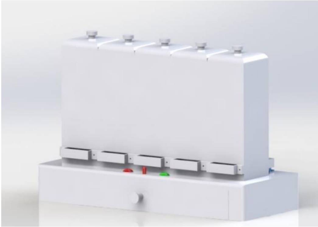
(a) Front view