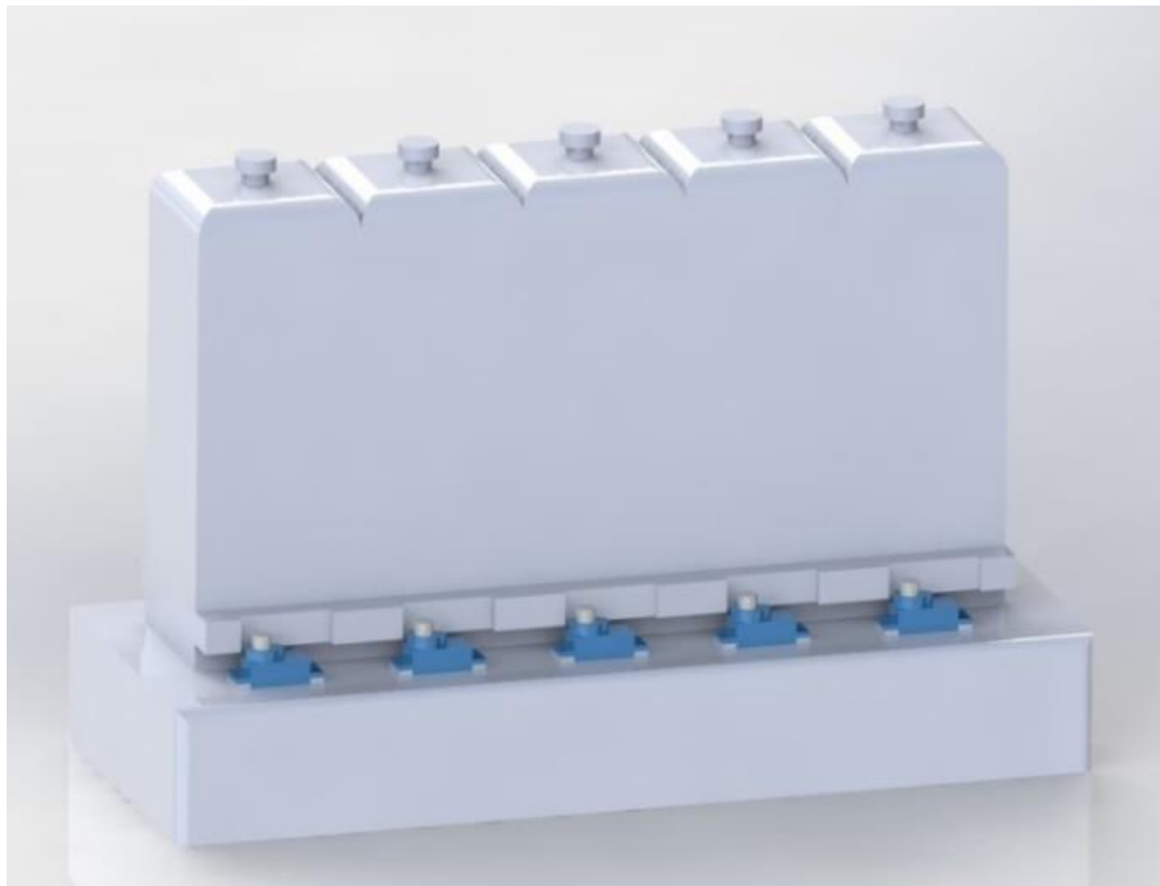
(b) Back view